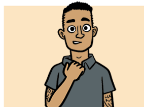
THE HAND ON HEART