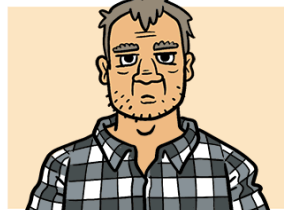
THE 'ALL GOOD' NOD