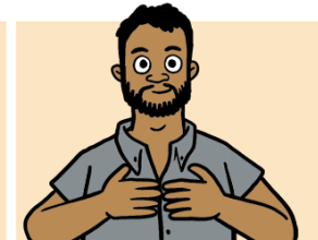
NZSL: HOW ARE YOU?