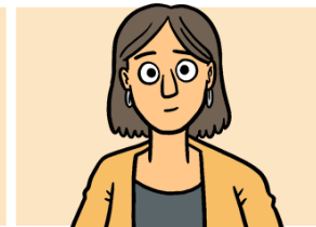
THE 'WHAT A WORLD EH?'