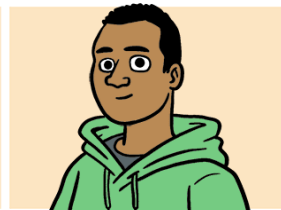
THE 'EAST COAST WAVE'