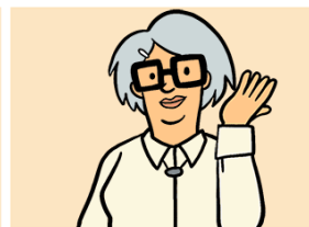
BLOWING A KISS